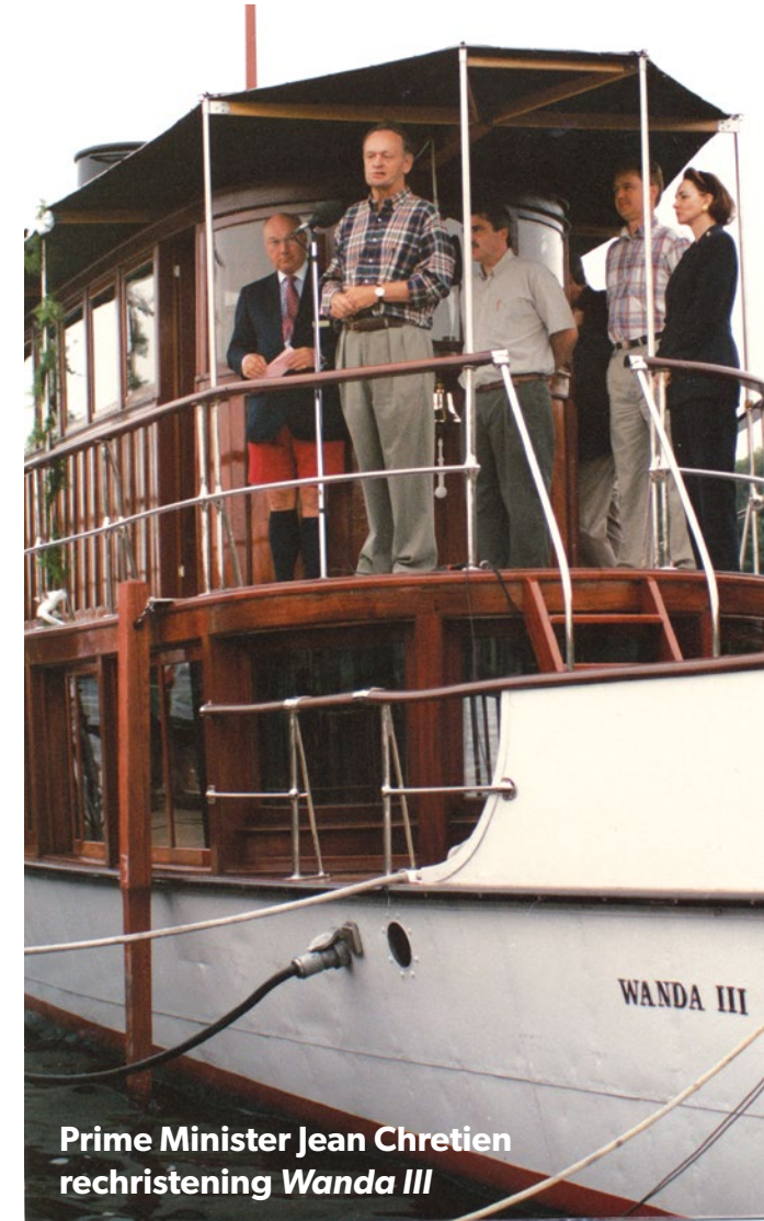
Prime Minister Jean Chretien rechristening Wanda III